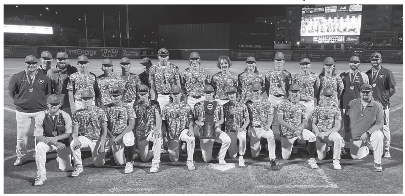
Waynedale High School | Division III Champions